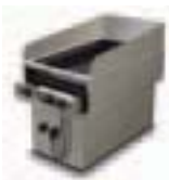
Also, the extraction module aircleanbox3d (as illustrated on left) based on the tried and tested down-draught principle, can be fitted into the ck-connect air frame.