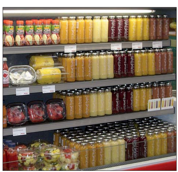
Producing large amount of smoothies in your supermarket or juices in the Juice Bar – the Kronen blender is exactly the right choice!