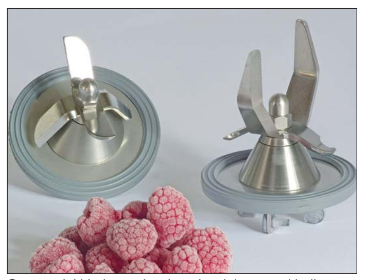
Our special blades on hardened stainless steel ball bearings guarantee long lasting and unsurpassed mixing qualities.

Easy to change, with stand high and low temperatures. Stand CC blades (right) and FD (left) for excellent whisking performance.