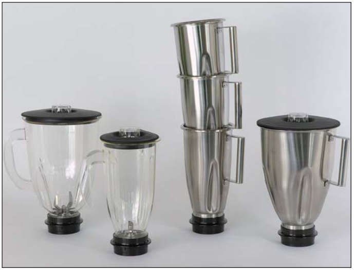
Space saving and practical – stackable jars available for 2 or 4 liters in polycarbonate or in robust stainless steel.