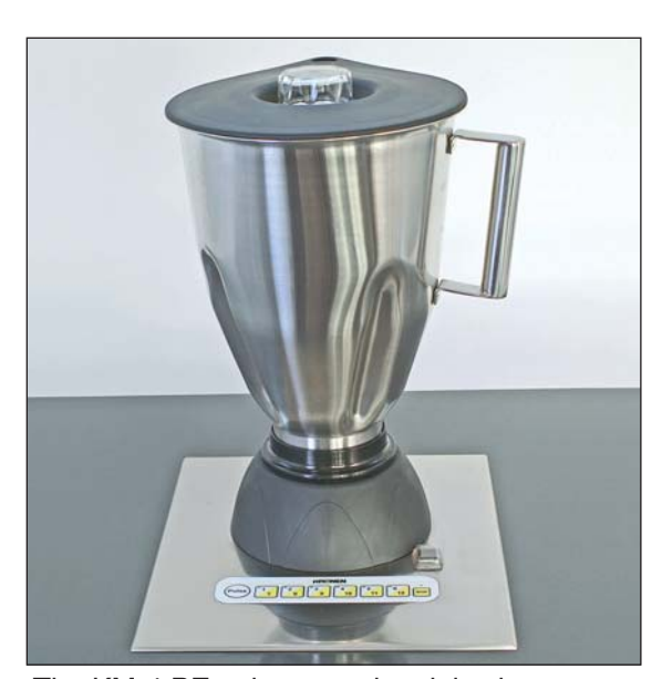
The KM-4 PE to integrate in a juice bar or service counter. Installation-Kit in hygienic stainless steel. 6 speeds or 12 programms.