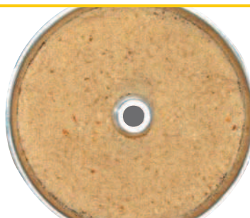
Almonds, nuts, breadcrumbs, cheese