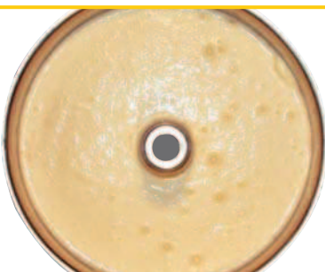
Mayonaise, sauces, dressings, soufflés