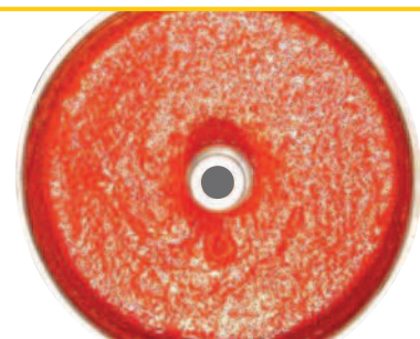
Soups, sauces, desserts, creams etc.