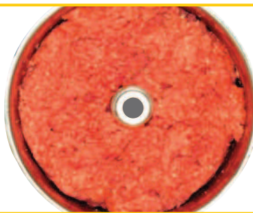
Stuffings, tartare, mince meat etc.

Mixing results like never before - with minimal heat production.