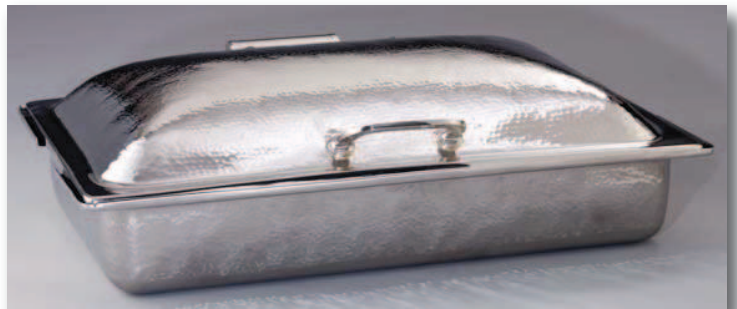
8 Qt. (G/N 1/1) Rectangular

In addition to Standard Pans, Half Pans and Divided Pans, we also have Shallow Food Pans (shown), Porcelain Pans and Divided Porcelain Pans (shown) for 2 Gal. Round Chafers.