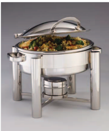
4 Qt. (3.8 Ltr) Round

The Tempo Collection of Hinged Chafers utilizes our Induction/Grill Chafers in our modern style Tempo frames with many complimentary matching buffet items.