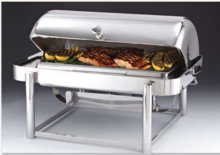
8 Qt. (G/N 1/1) Tempo Chicago Rolltop