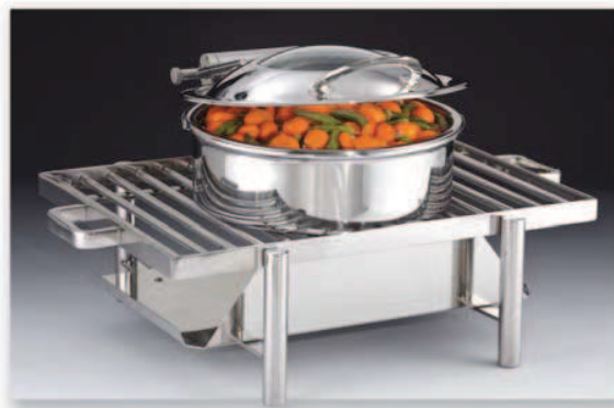
Heater Stand Tempo 20" x 14" w/Grill