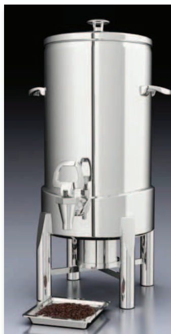
Tempo2 Cylinder Coffee Urn w/Stand