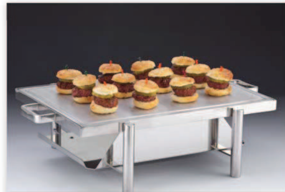
Heater Stand Tempo 20" x 14" w/Aluminum