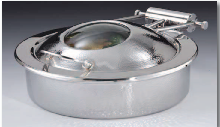
2 Gal (5.7 Ltr) Round w/Glass