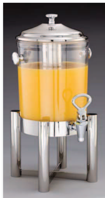
7 Qt. (6.6 Ltr) Tempo Juicer