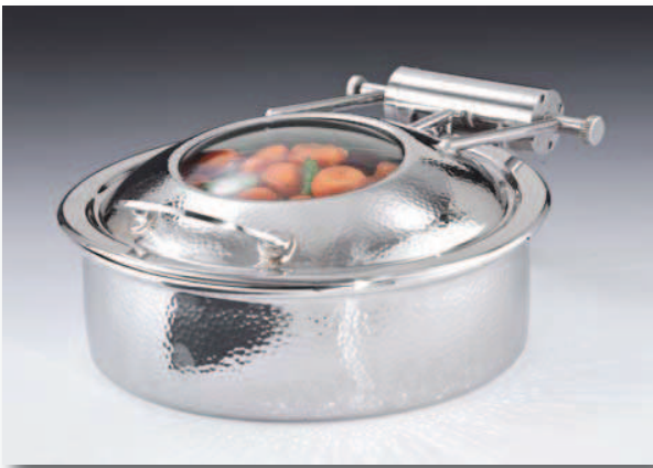
4 Qt. (3.8 Ltr) Round w/Glass