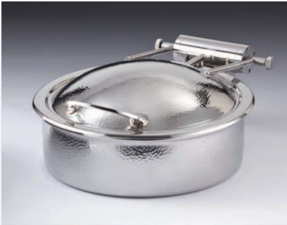
4 Qt. (3.8 Ltr) Round