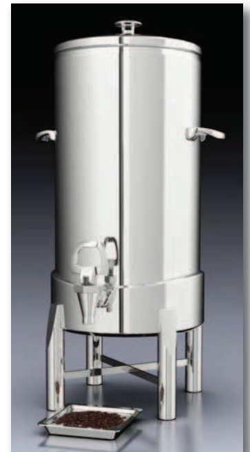
Tempo2 INSULATED Cylinder Coffee Urn w/Stand