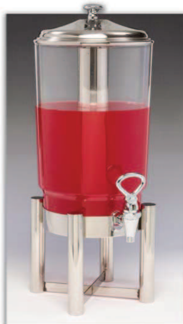
12 Qt. (11.4 Ltr) Tempo Juicer