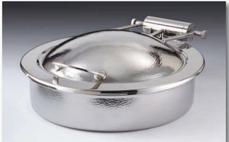
2 Gal (5.7 Ltr) Round