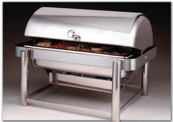
8 Qt. (G/N 1/1) Rectangular Tempo Rolltop - 100% Silver Soldered