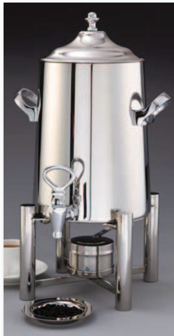
Tempo Chicago Coffee Urn