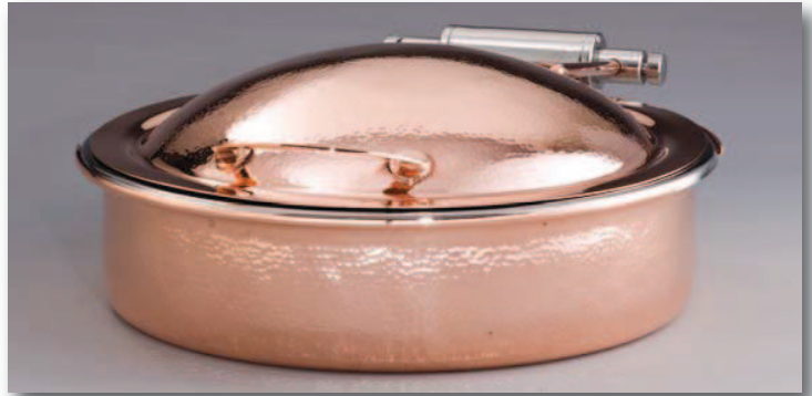
2 Gal (5.7 Ltr) Round Copper

Our effortless opening Induction/Grill Chafers with a hammered finish for a unique, rich, residential feel (and minimal finger prints!)