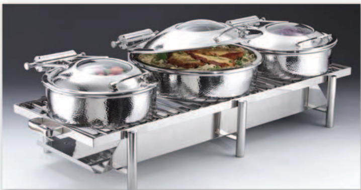
Heater Stand Tempo 40" x 14" w/Grill