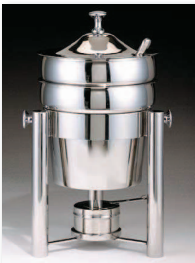
6 Qt. (6 Ltr) Marmite