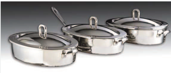
3.5 Qt. (3.3 Ltr) Oval Liftoff Grill Top Chafers