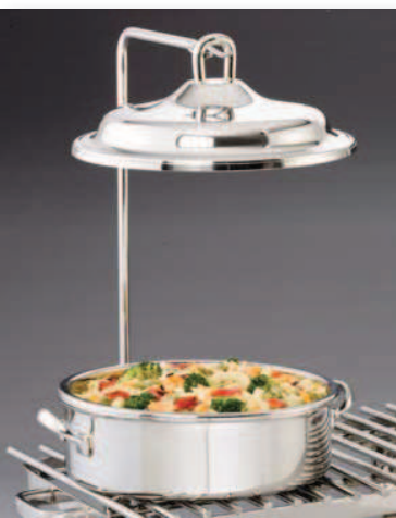
4 Qt. Round (3.8 Ltr) Liftoff Grill Top Chafers w/Lid Stand