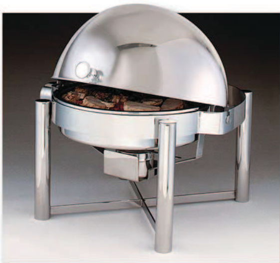
2 Gal. (5.7 Ltr) Round Tempo Rolltop -100 % Silver Soldered