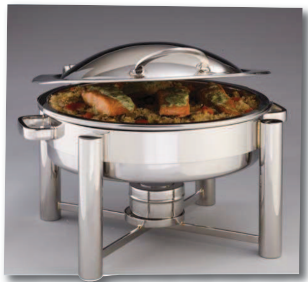
2 Gal. (5.7 Ltr) Round