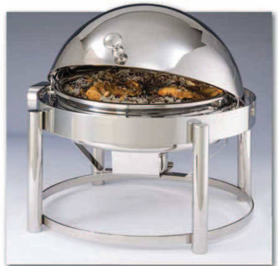
2 Gal. (5.7 Ltr) Round Chicago Tempo Rolltop