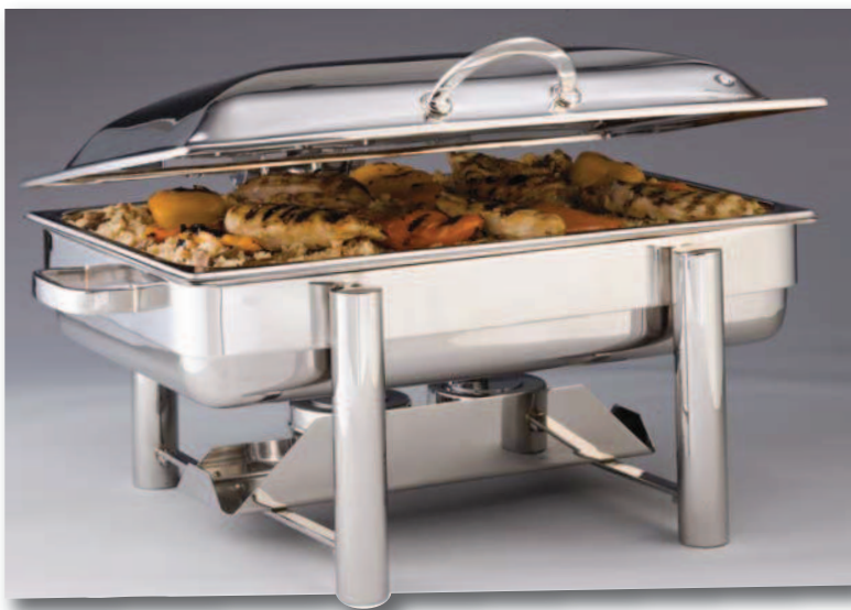
8 Qt. (G/N 1/1) Rectangular