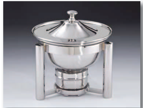
1 Qt. (.95 Ltr) Tempo Liftoff Chafers