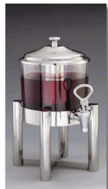
4 Qt. (3.8 Ltr) Tempo Juicer