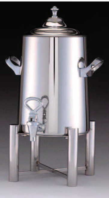
INSULATED Tempo Coffee Urn