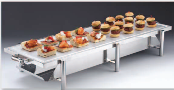
Heater Stand Tempo 40" x 14" w/Aluminum