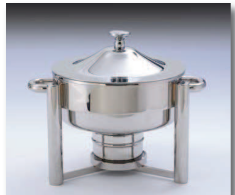
2 Qt. (1.9 Ltr) Tempo Liftoff Chafers