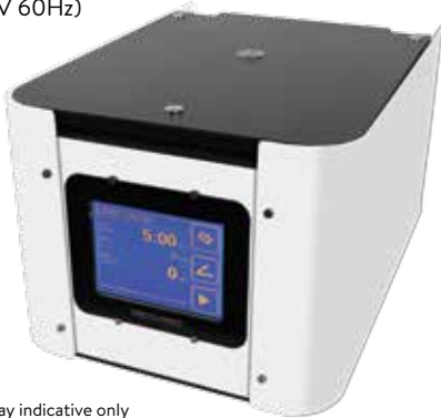
Display indicative only