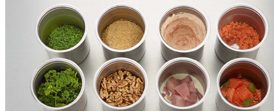
Before/after: examples for the highly-versatile functionality for "mise en place" or processing "à la minute". Finely-chopped herbs, nuts, farces, fish tartare, whipped cream and much more.

The Pacojet Coupe Sets have a wide range of applications. Textures can be modified by processing foods using the repeat function and over-pressure mode.